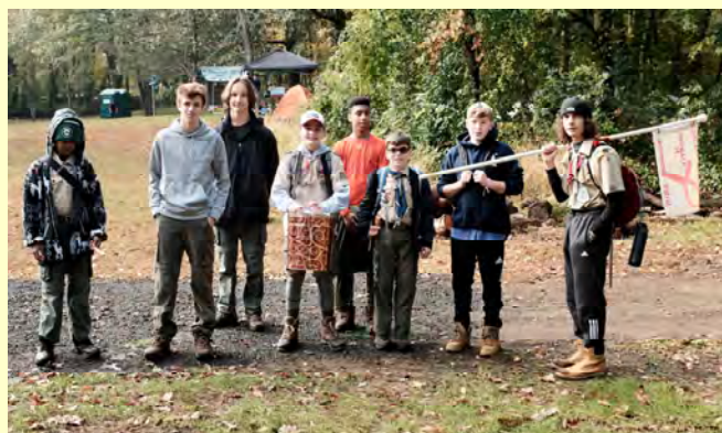
Troop 14 Norwalk/Troop 5 Stamford 3rd Place Super Troop 1st Place Super Patrol Faze