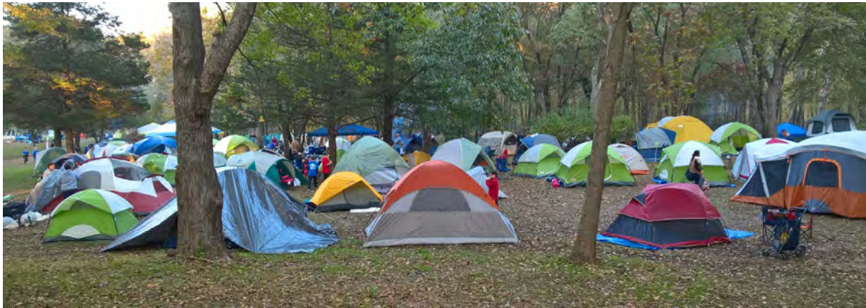
Photo: Tent City at the Cub Scout Field Day