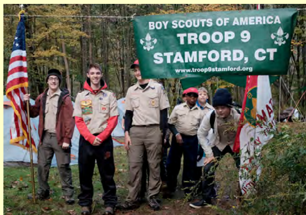
Troop 9 Stamford 1st Place Super Troop 3rd Place Super Patrol Whales

2018 Fall Camporee Wrap-up — Hosted by Troop 19 Norwalk