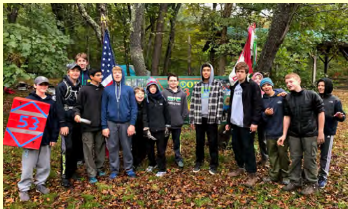
Troop 53 Darien 2nd Place Super Troop 2nd Place Patrol Faze