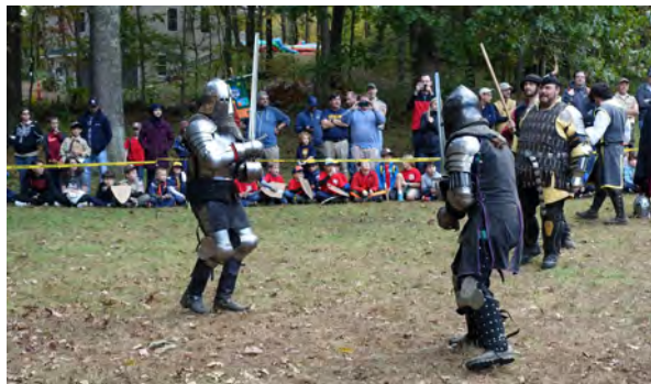
Knights of Gore battling it out.