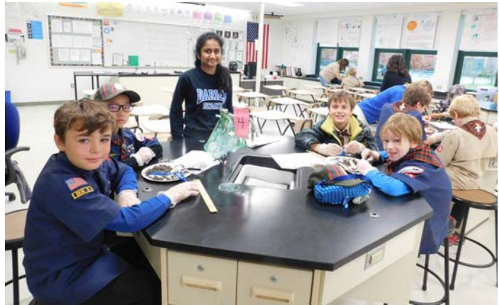
STEM Crew 353 Darien at the Webelos College